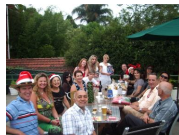
Staff end of year celebration Petersham Bowling Club

The 2009 Year ended with a great sense of optimism for both staff and residents of Stretch-A-Family. It was a very successful year for SAF – marking the achievement of a number of significant goals which included the physical separation of the Foster Care and administration of the agency away from Stanmore House to our new Head Office. Our staff end of year celebration was a Lawn Bowls and BBQ at Petersham Bowling Club. A few talented bowlers were identified and some of us learned that lawn bowls is a lot harder than it appears to be!