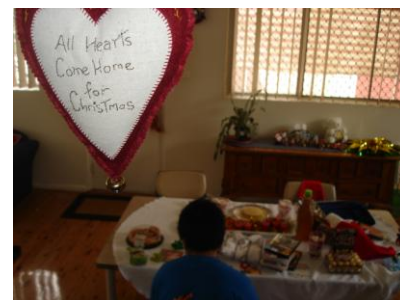
Christmas Day at On Track

Stanmore House residents and staff attended Carols at Pioneer Park at Leichhardt. They joined in all the festivities of this community event including singing and rapping to the Christmas carols. They also recycled some colourful lanterns to bring home with them to decorate Stanmore House.