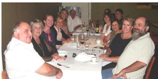
Foster Carers Annual Thank You Dinner

The foster care team are enjoying an exciting time of growth and development. Our recruitment campaigns including with WSFM and the Inner West Courier have led to the Foster Care team fielding a record number of foster carer enquiries over the past few months. Our prospective carers are in the process of being assessed and attending Shared Stories, Shared Lives foster care training. Our foster families have had a busy holiday period and the young people have enjoyed diverse activities including a multitude of camps with Lutanda, Vision Valley, Narrabeen Sports, Hillsong and Dept of Sport and Rec and also travel further afield to Taree and Samoa.