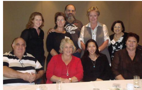
Right: Carers and staff at the Training night at Bankstown Sports Club